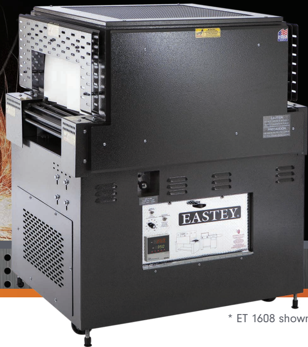
* ET 1608 shown